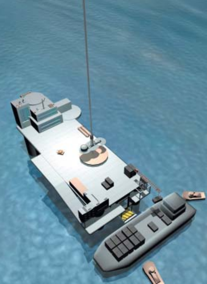
The ocean-going anchor platform is shown with a cargo vessel near-by and the ribbon extending vertically.