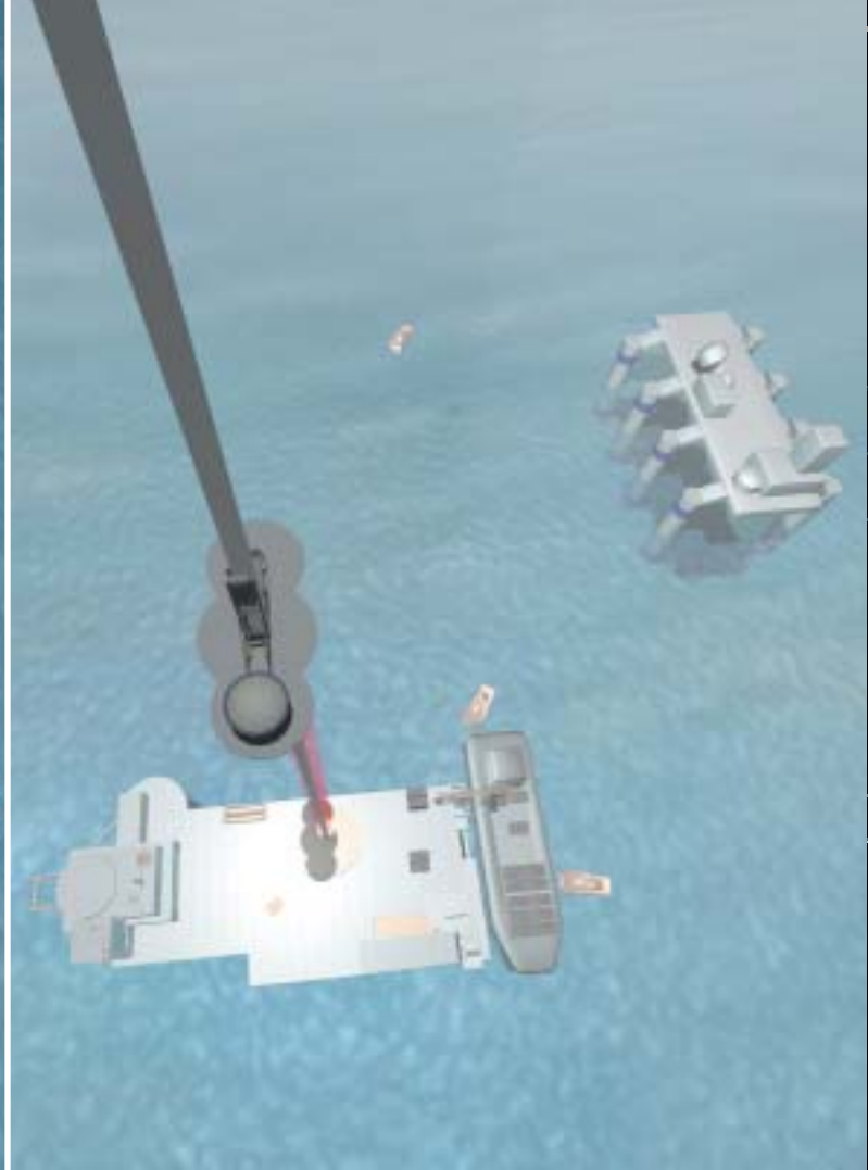
The major components of the space elevator are shown. The climber is in the foreground ascending the ribbon, the ocean-going anchor station is at the bottom of the image and one of the power beaming platforms is shown in the upper right of the image.

According to Edwards, here's how the elevator would be assembled in space: