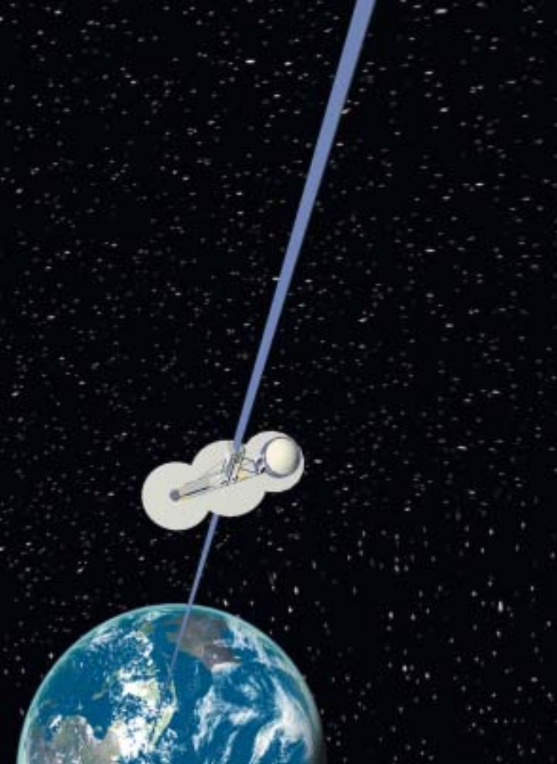
The space elevator climber is shown ascending the ribbon to high-Earth orbit. The circular structures are photo arrays, the drive section is seen as two treads sandwiching the ribbon, and the command and control components are the small box structures. The payload, a satellite, is shown on the lower half of the climber.