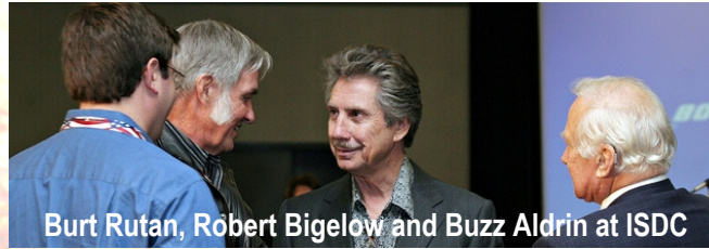
Burt Rutan, Robert Bigelow and Buzz Aldrin at ISDC

Get Energized – Make new friends at our annual International Space Development Conference (ISDC®), and compare notes, assess the status, and plan for the future. Meet astronauts, government and space industry leaders, space entrepreneurs, scientists, educators, and space advocacy leaders. Network and learn about the latest advances in space exploration and development at ISDC talks, meal events, workshops, tours, exhibits, and fun socials. See: isdcs.nss.org