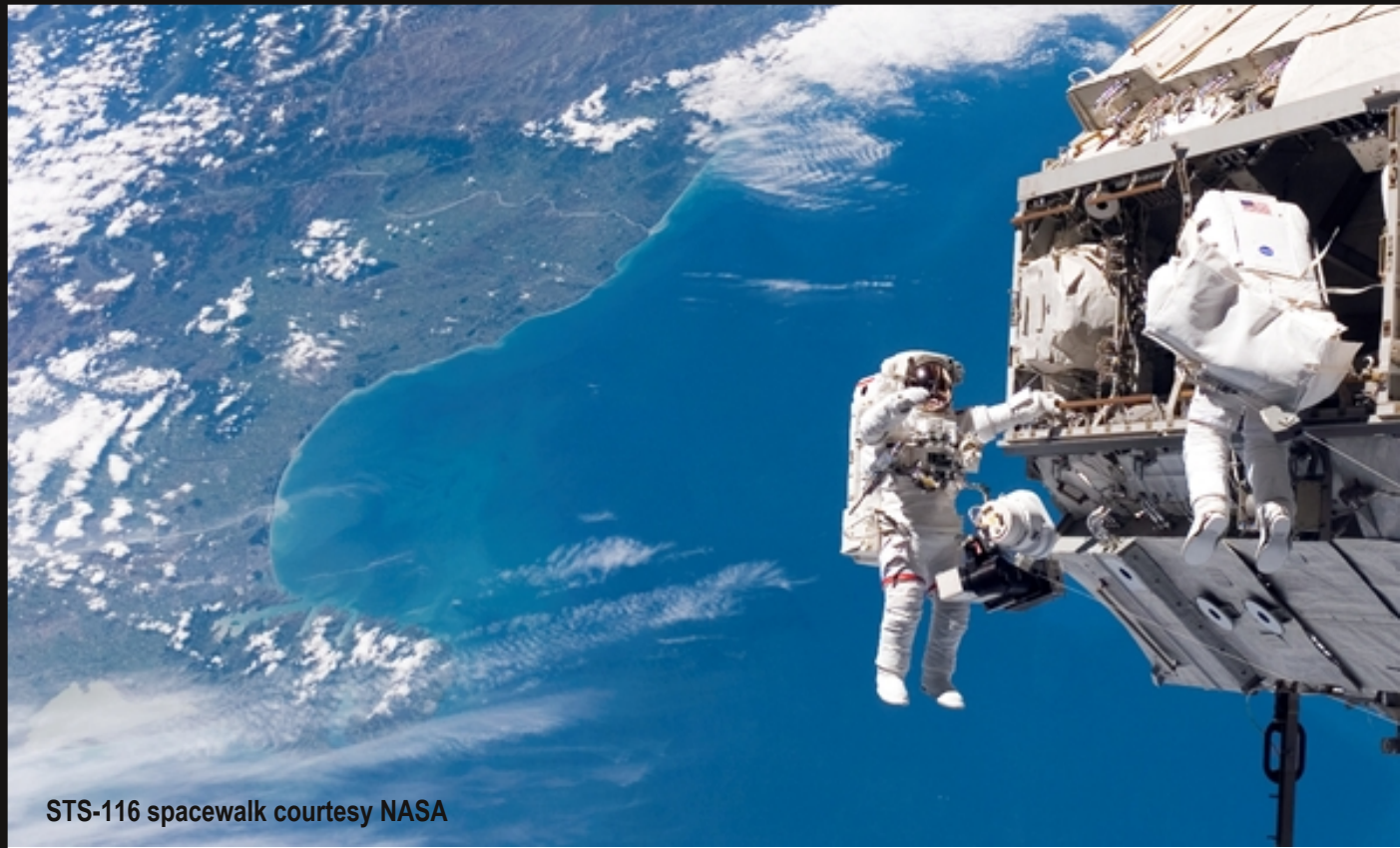
STS-116 spacewalk

In order for us to have a future that's exciting and inspiring, it has to be one where we're a spacefaring civilization. -- Elon Musk