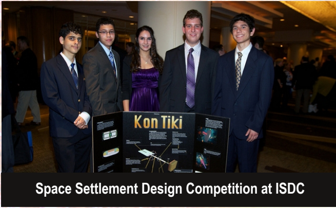
Space Settlement Design Competition at ISDC