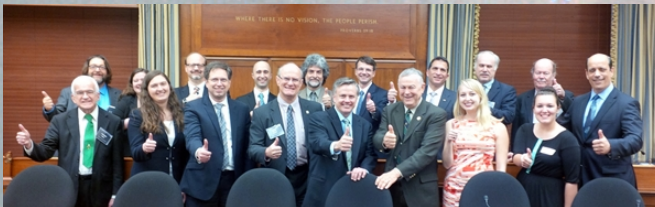
Visiting Congress at March Storm, a joint project of Space Frontier Foundation and NSS

Make the Case for Space – Ensure your voice is heard. Shape the space legislative agenda by sharing your views and priorities on various current and future space projects. NSS offers multiple avenues, such as the NSS Political Action Network (PAN), the Space Exploration Alliance Legislative Blitz, the March Storm, the Alliance for Space Development, and more that enable you to make the case for space with your elected officials. See: go.nss.org/legislative